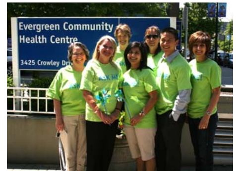
VCH Implementation Team Evergreen Community Health Centre

VCH is moving forward with additional implementations of BC PSLs at numerous acute, community and residential facilities over the coming months. Richmond Health Services was the first health service delivery area in BC to implement the system across the full continuum of care. Congratulations to the VCH team!