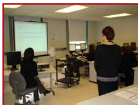
BC PSLs 'Boot Camp'

Activity is buzzing at VIHA as they prepare for their first BC PSLs go live at Saanich Peninsula Hospital in February! A steady stream of implementations will follow until the end of March as the system spreads throughout the region, and education and training activities ramp up.