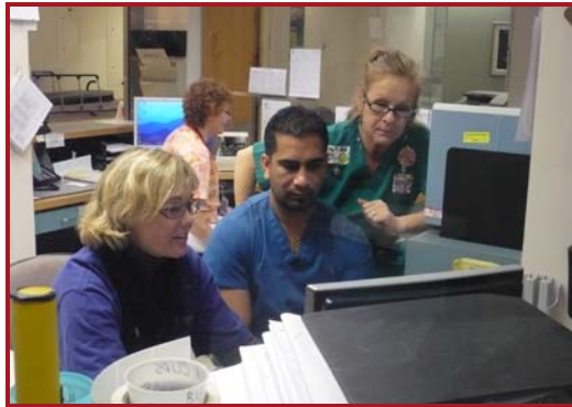
New users at Peace Arch Hospital